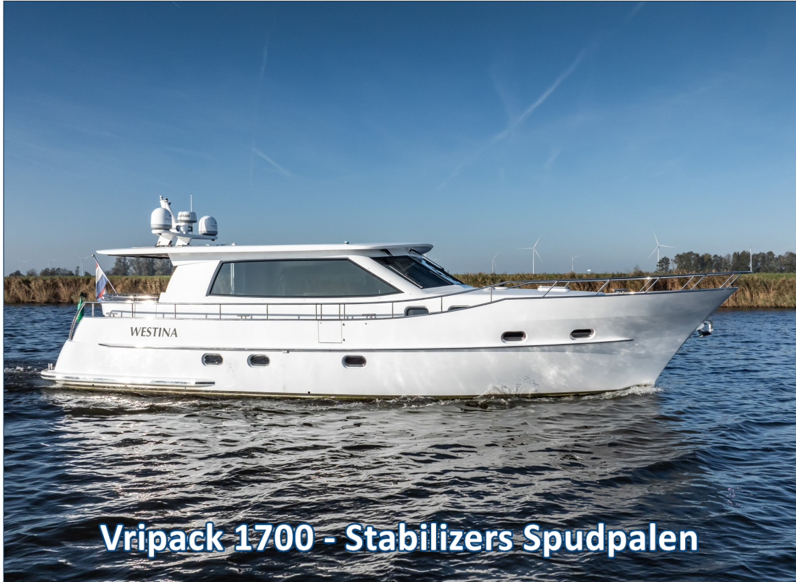
Vripack 1700 - Stabilizers Spudpalen