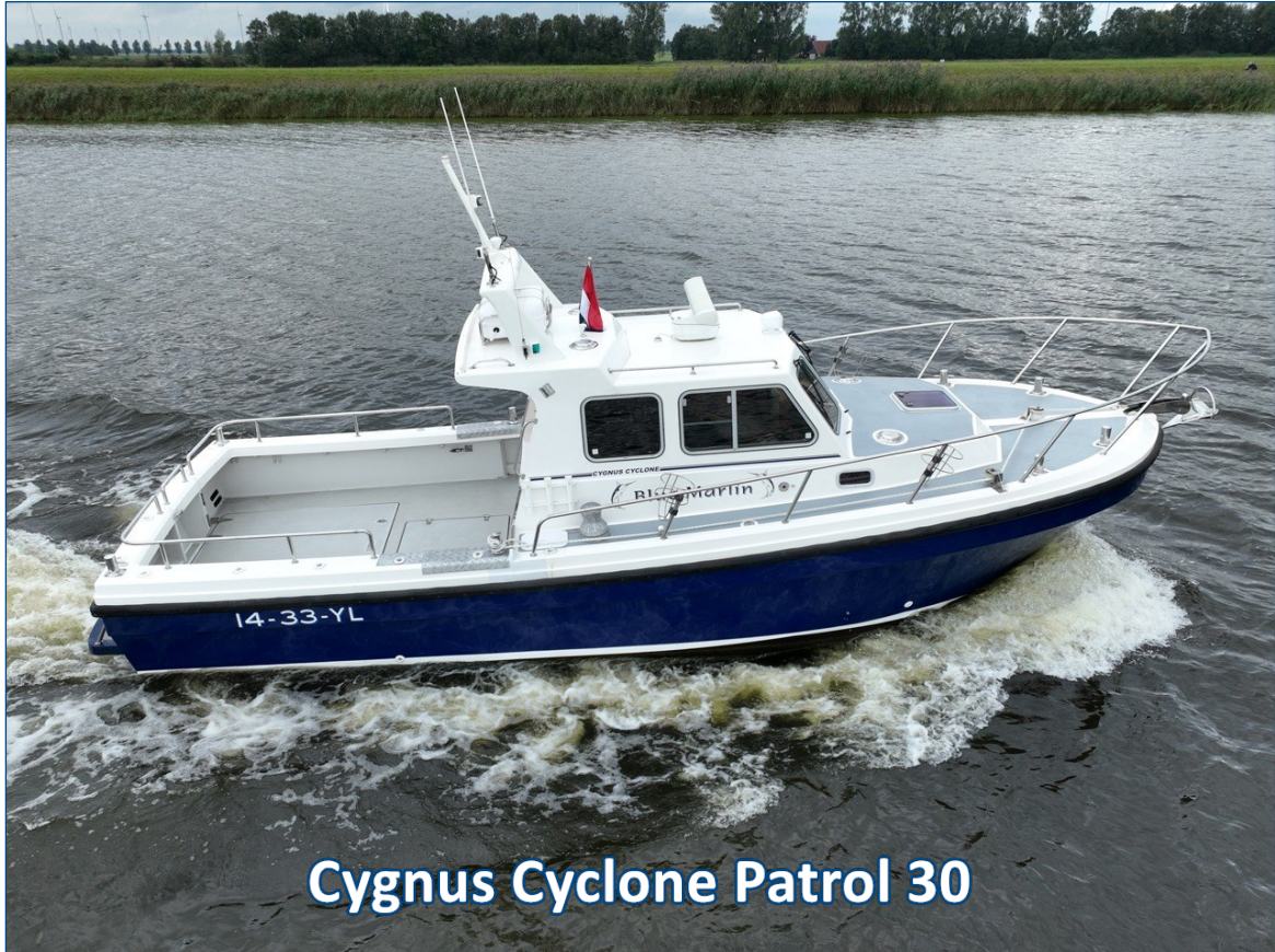
Cygnus Cyclone Patrol 30