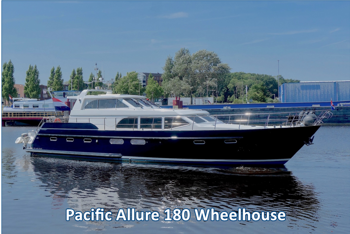
Pacific Allure 180 Wheelhouse